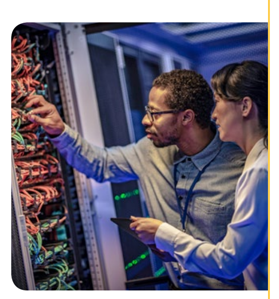
*For qualified participants